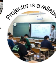
Projector is available.